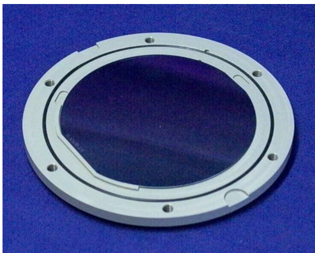
Fig 2: Etching chuck for 100 mm wafers in PEEK