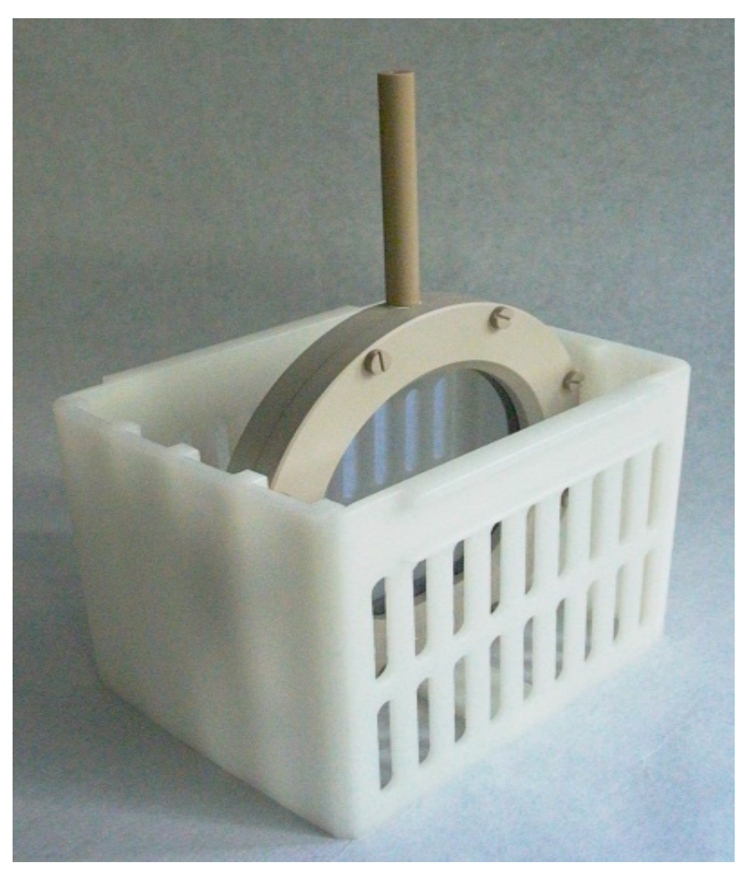
Fig. 2: Wafer chuck carrier designed to the clients specifications.

Wafer chuck carriers for multiple wet processing wafer chucks can be designed to your needs. Most carriers were designed to fit exactly into our clients etching equipment.