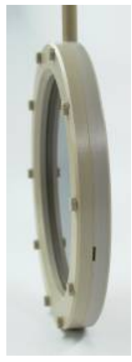
Fig. 1: Etching chuck for 100mm and 200mm wafers in PEEK (left) with ventilation tube (right).